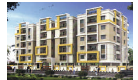
ABHIRAM'S RAGHAVA ENCLAVE @ Madhurawada, Visakhapatnam