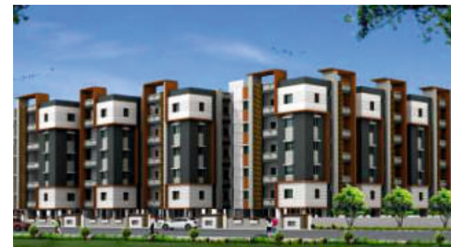
ABHIRAM BLUE HEAVENS @ Aganampudi, Visakhapatnam