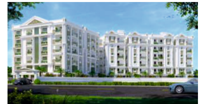
ABHIRAM BLUE BAY TOWERS @ China Waltair, Visakhapatnam