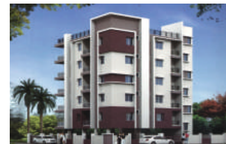
ABHIRAM JASMINE HEIGHTS @ Kurmmannapalem, Visakhapatnam