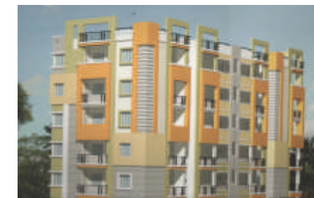
ABHIRAM'S KINGS COURT @ Gajuwaka, Visakhapatnam